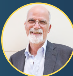
Maurizio Prato Ikerbasque Research Professor CIC biomaGUNE, Spain